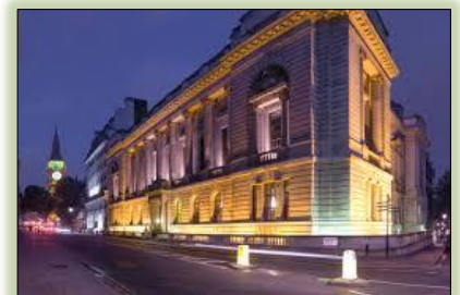
One Great George Street