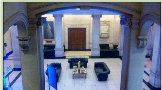
Entrance of the Brunel Room closed after the speech