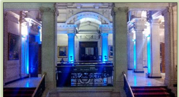
Entrance of the Great Hall.