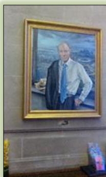
Sir John Armitt Portrait unveiled and placed at ICE's front door for 1 year