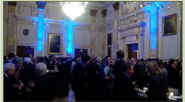
Drinks and canapé reception followed the speech in Great Hall