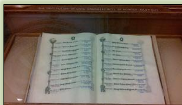
ICE Roll of Honor 1939-1945